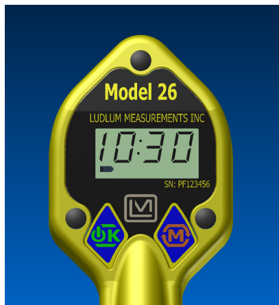
Figure 2.3: SCALER mode operation showing SCALER Timer of 10 minutes, 30 seconds.