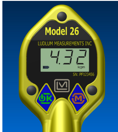
Figure 2.1: NORMAL mode display showing typical background radiation rate and the low-battery icon.

Mode Button: Used to advance between the three operating modes, NORMAL, MAX, and SCALER. Note that MAX and/or scaler mode may be disabled from use by the administrator or calibrator.