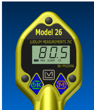
Figure 2.2: MAX mode operation display with ALARM indicator.