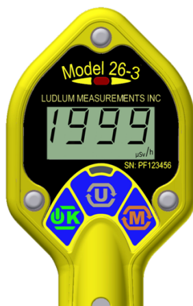
Figure 2.4: Detector Over Range (shown for \mu\text{Sv/h} ); will also flash.