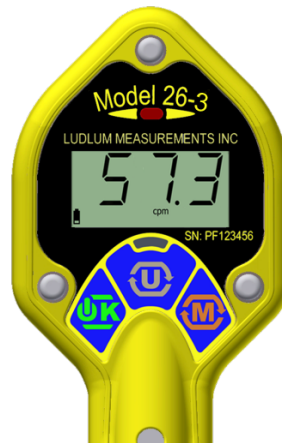
Figure 2.5: RATE mode display showing typical background radiation rate and the low-battery icon.

If other operational modes are available, pressing the MODE button will move to the next available operational mode.