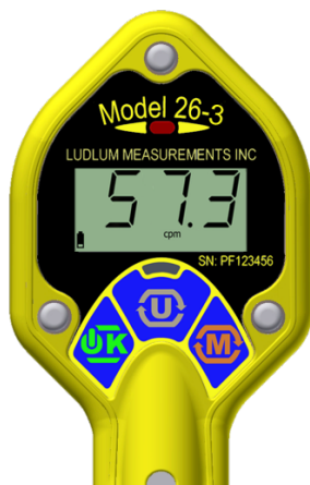
Figure 2.7: COUNT mode operation showing COUNT Timer of 10 minutes, 30 seconds.