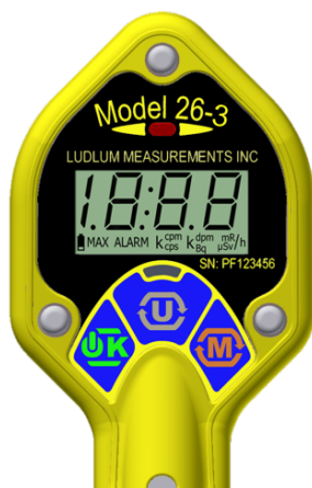
Figure 2.1: Startup display for the Model 26-3, with all LCD segments shown.

The instrument then displays the firmware version number and activates the Alarm LED briefly. Should the Alarm LED fail to turn on, the device is in need of repair. Please refer to the figure below.