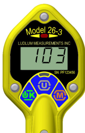
Figure 2.2: Firmware version display and Alarm LED check shown.

The instrument then displays the firmware version number and activates the Alarm LED briefly. Should the Alarm LED fail to turn on, the device is in need of repair. Please refer to the figure below.