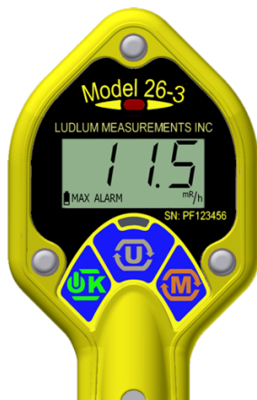
Figure 2.6: MAX mode operation display with ALARM indicator and alarm LED.

If other operational modes are available, pressing the MODE button will move to the next available operational mode.