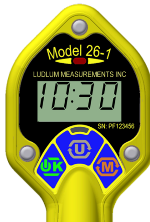
Figure 2.6: COUNT mode operation showing COUNT Timer of 10 minutes, 30 seconds.