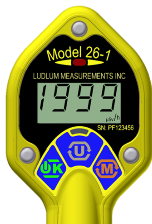
Figure 2.4: Detector Over Range (shown for \mu\text{Sv/h} ); will also flash.