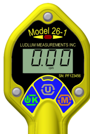
Figure 2.3: Detector Failure display (shown for cpm); will also flash.

Note that the Model 26-1 has its own diagnostic tests to ensure that the detector is functioning correctly. The Model 26-1 can detect when the radiation detector is malfunctioning and will flash the display to indicate a fault. If the detector stops detecting radiation for 60 seconds, normally through a puncture of the thin mica window, the Model 26-1 will flash a zero reading for the currently selected units. If this indication is observed, remove the unit from service and have it evaluated by a qualified repair and calibration technician.