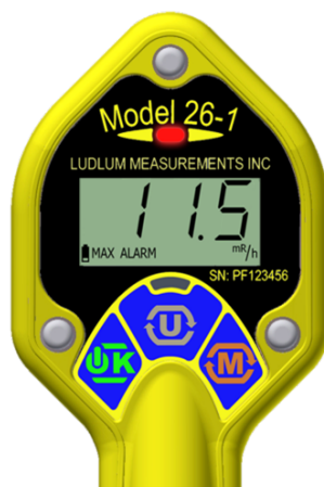
Figure 2.5: MAX mode operation display with ALARM indicator and alarm LED.

If other operational modes are available, pressing the MODE button will move to the next available operational mode.