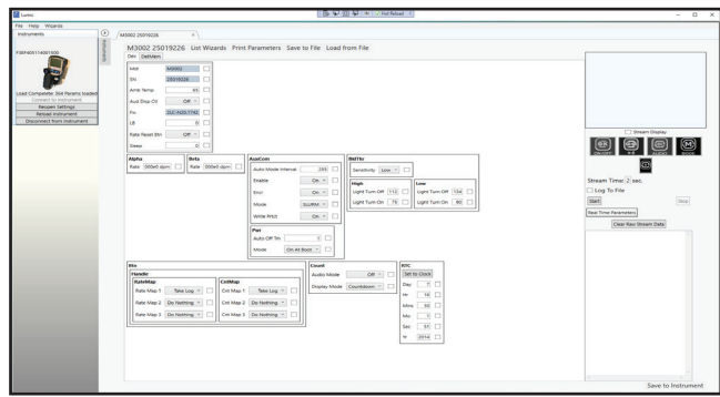
Version 1.0 for Model 3000 Series