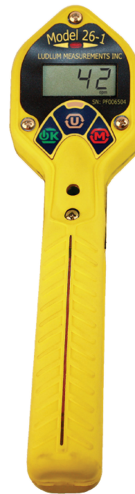
Model 26-1 Part Number: 48-3965