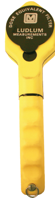
Model 26-1DOSE Part Number: 48-4007