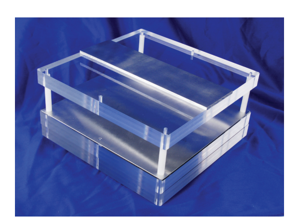
Acrylic Modular X-ray Phantom